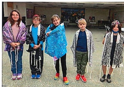
4 th /5 th Grade Tallit Project