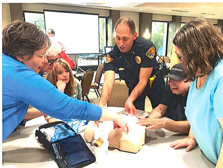
Oakwood Public Safety officers showed congregants how to use a defibrillator at the Annual Meeting in May.

Thanks to our officers, board members, staff, and all members of Beth Abraham for your commitment. Have a great summer and stay involved.