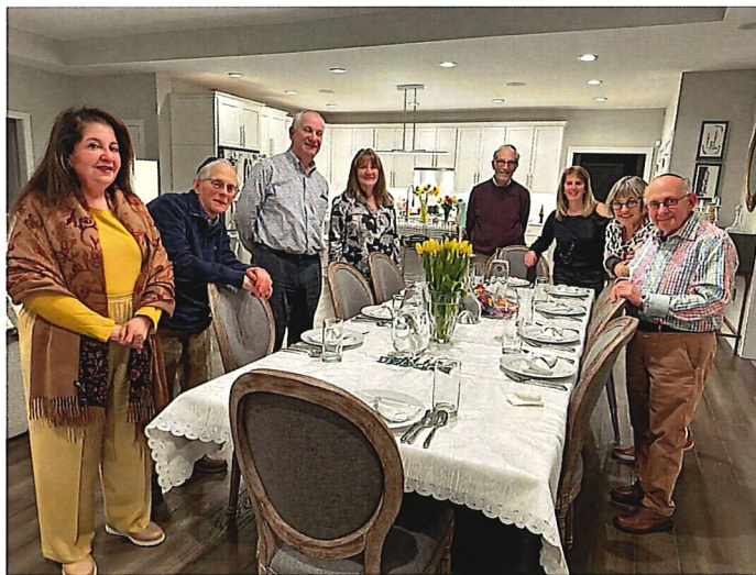
Guess Who's Coming to Shabbas? was a fun time for all.