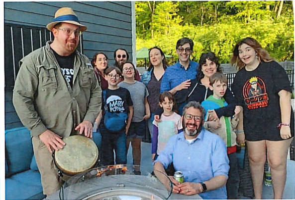
Celebrating Lag B'Omer

Our Social Action project for Sunset in the Sukkah is "SuCoats." We will be collecting coats, and encourage all knitters and crocheters to begin making warm weather accessories.