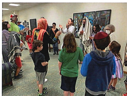
Moses and the Israelites