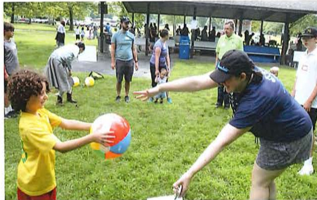
Participants enjoyed a number of activities, including yoga and games, at the community Field Day sponsored by Beth Abraham and 7 partnering organizations through a Federation Innovation Grant.