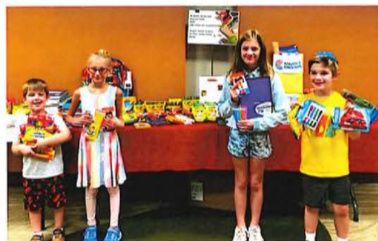
Our school supply collection table was overflowing with donations, which will be given to Crayons to Classrooms.

As well, starting this year the flags that are placed by the graves of our military veterans on Memorial Day weekend will be collected around July 4th rather than left in place until the following Memorial Day. The appearance of the flags has become an issue and the Jewish War Veterans who distribute the flags can now recycle them. Collecting flags soon after Memorial Day is actually the established protocol by most veterans groups including the American Legion.